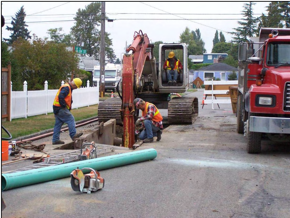
Figure 3. Spot Repair/Pipe Replacement Construction

The repair/replacement contract consisted of all the open-trench excavations that were required based on the CCTV review. These open-trench repairs replaced severely sagged pipe, removed pipe that had collapsed and replaced pipe that was undersized. Generally, the contractors bidding the repair/replacement project were local contractors familiar with SWSSD and the local road and land use agency requirements. This meant that these contractors understood the risks and requirements for constructing the project in the area and did not need to inflate their bids to cover those factors.