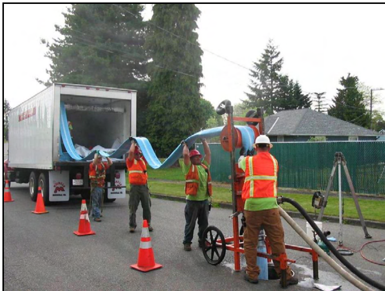
Figure 5. CIPP Rehabilitation

As previously mentioned, SWSSD began a sewer rehabilitation program in 2006. The program was started by compiling the CCTV inspection work that had been performed on some of the oldest sewer lines in the District, located in the Chelsea Park neighborhood. The majority of the lines in this neighborhood consisted of 8” to 15” diameter concrete sewer lines. SWSSD had obtained approximately $4.6 million in State funding for this project to replace 32,000 feet of sewers lines. As part of the proposal process, Roth Hill recommended the use of CIPP rehabilitation (Figure 5) instead of the more common open-trench replacement of the sewer lines with the understanding that far more than 32,000 feet could be rehabilitated using this technology.