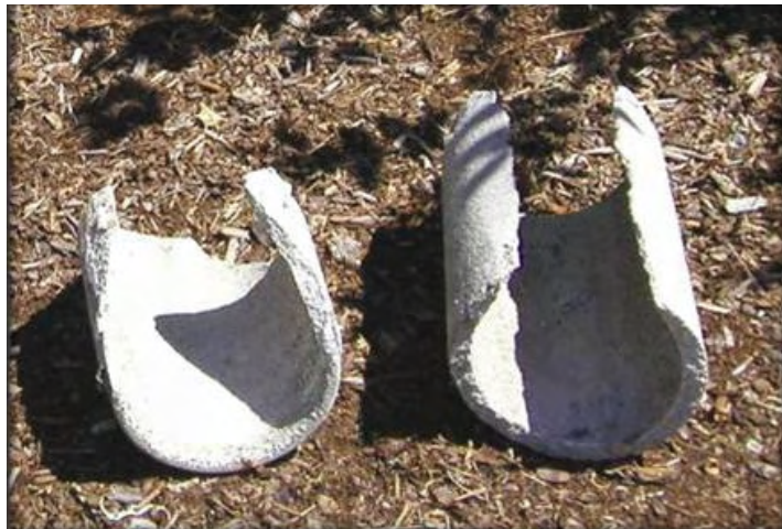
Figure 1. Existing sewer pipe from Chelsea Park Sewer Rehabilitation Project.

In 2006, SWSSD began a program geared towards the rehabilitation or replacement of some of the first sewer lines installed in the District. The majority of these lines consisted of 8" to 15" diameter concrete sewer lines that were installed more than 60 years ago. SWSSD has its own closed-circuit television (CCTV) truck and crew that conducted the inspection process in preparation for the rehabilitation work. By conducting CCTV inspections on the existing sewer lines prior to construction, it allowed SWSSD's engineer, Roth Hill, LLC (Roth Hill), to complete a preliminary engineering investigation to identify issues with the existing sewer lines that could complicate or prevent the installation of a CIPP liner.